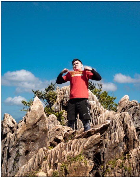
Picture 4. Sharpening my Physical Saw: Mountain Climbing @ Mt. Daraitan, Tanay, Rizal

Aside from work, the scholarship also helped me to realize the importance of taking care of your mental, physical, and spiritual body. It has shaped me to begin with the end in mind, as Dr. Covey said “Your most important work is always ahead of you, never behind you.” Even though it’s not directly related, the scholarship helped me realize the value of education and the thing it gives you in your daily lives. To date, it has been my personal commitment to seek continuous improvement and renewal both professionally and personally.