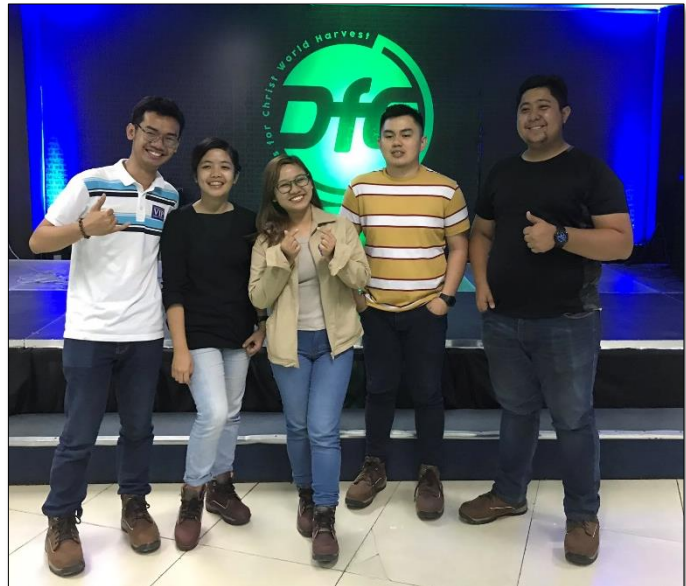
Picture 5. Sharpening my Spiritual Saw: Weekly service @ UN Avenue, Manila