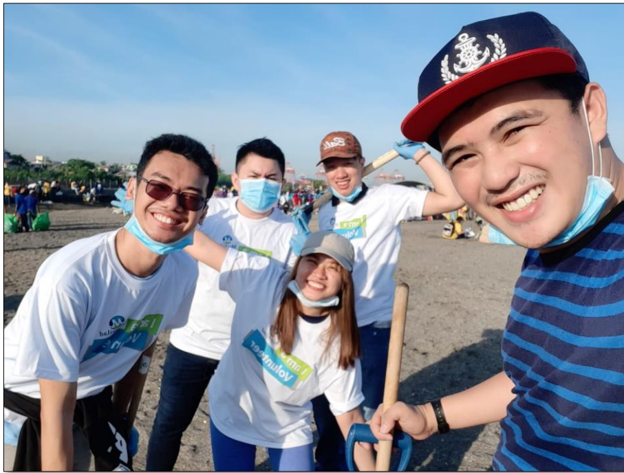
Picture 6. Modern Battle of Manila Bay: Coastal clean-up in Baseco Compound, Port Area, Manila

Humans, though often unintentionally, have the most detrimental impact on the environment. However, there are a multitude of ways in which we help the environment as well. As for me, I participated in the annual Battle for Manila Bay clean up headed by the Department of Environment and Natural Resources. Aside from the Manila Bay, the other bodies of water in the country have been given long overdue attention. Companies like Maynilad Water Service, Inc. have been doing their corporate social responsibility programs at coastal communities in order to try and mitigate the effects of solid waste pollution, particularly plastic that has been improperly disposed of.