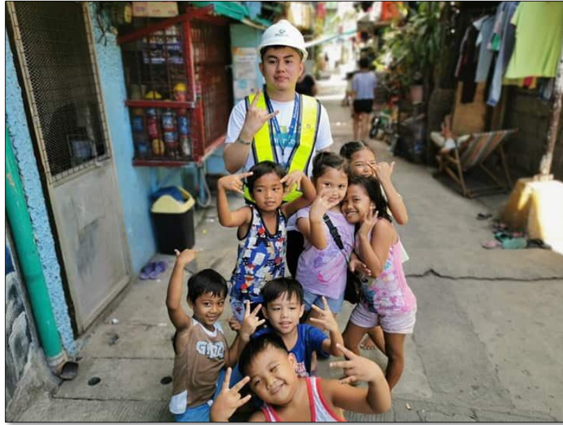
Picture 3. Septage desludging services in Malate, Manila

Aside from work, the scholarship also helped me to realize the importance of taking care of your mental, physical, and spiritual body. It has shaped me to begin with the end in mind, as Dr. Covey said “Your most important work is always ahead of you, never behind you.” Even though it’s not directly related, the scholarship helped me realize the value of education and the thing it gives you in your daily lives. To date, it has been my personal commitment to seek continuous improvement and renewal both professionally and personally.