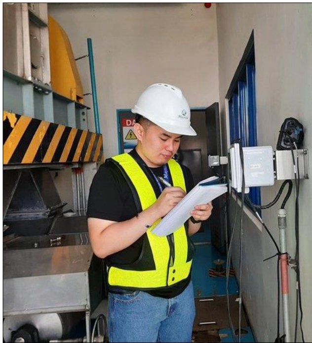
Picture 1. Recording the results of pH and DO of Aerated Water in Alabang-Zapote Septage Treatment Plant